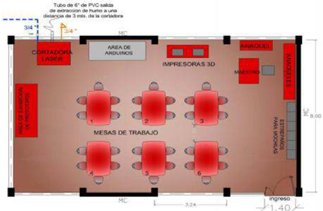
Figure 2. Proposed configuration of the FabLearn Laboratories spaces.