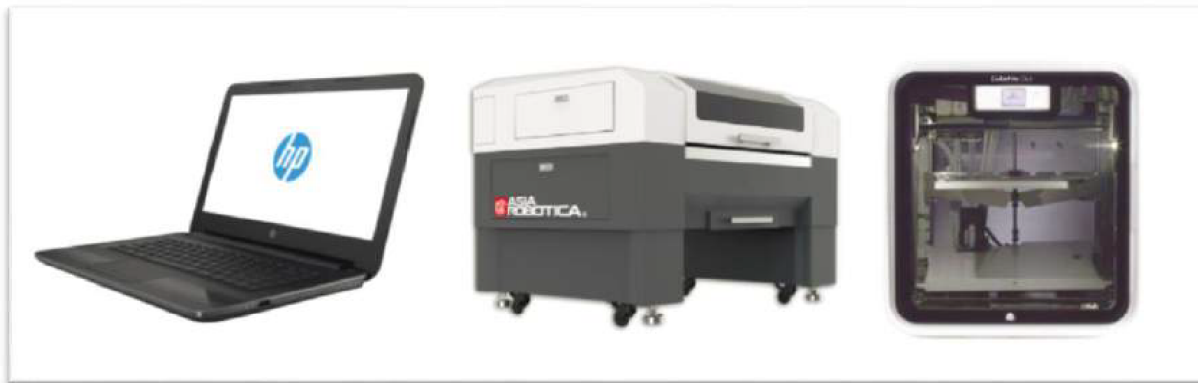
Figure 1. Equipment acquired by the PROSOFT 2016 Project: laptops (HP), laser cutters (Asia Robotics) and 3D printers (CubePro)

These devices and which are the physical components that help the manifestation of the digital construction of this Project are 3: the laser cutter, the 3D printer and a laptop (Figure 1).